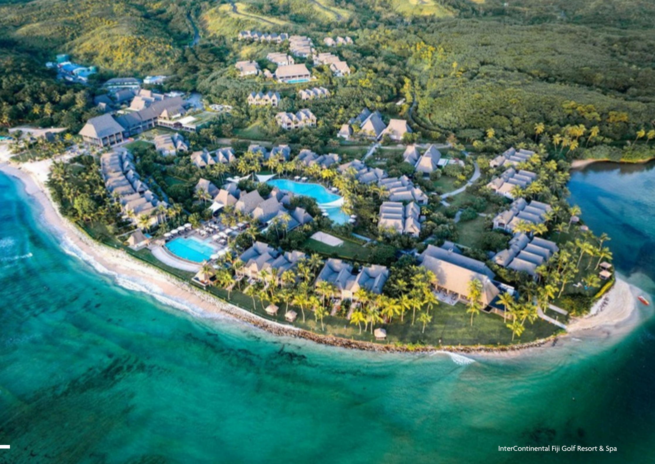
InterContinental Fiji Golf Resort & Spa