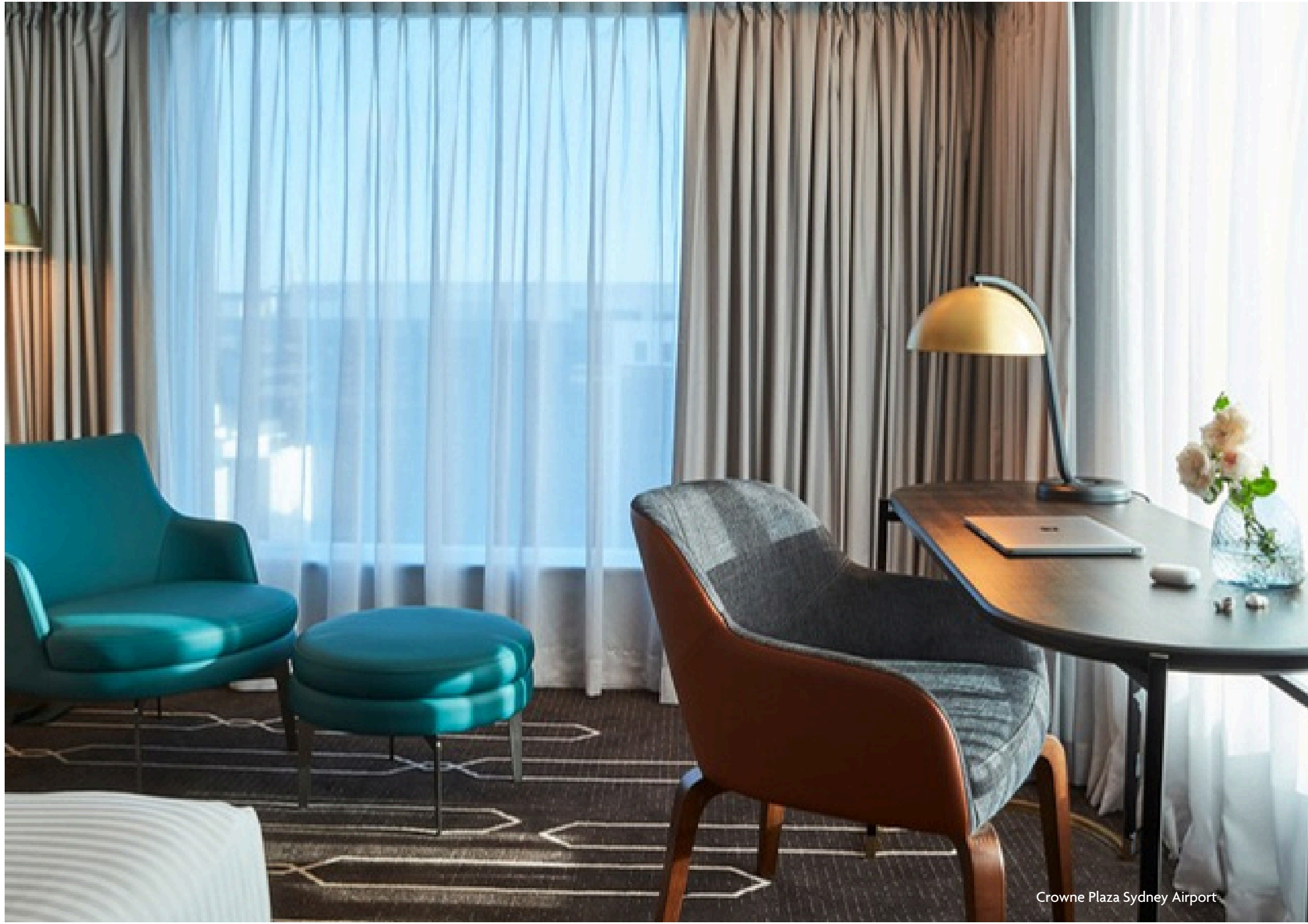
Crowne Plaza Sydney Airport